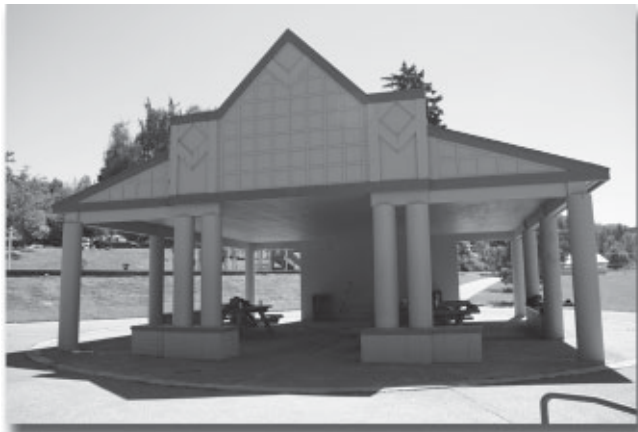
Tibbetts Valley Park Picnic Shelter

Venture outdoors and experience Issaquah recreation at its best! Take a stroll on one of the many trails, enjoy a picnic with a spectacular view or cheer your team on to victory at one of the ballfields!