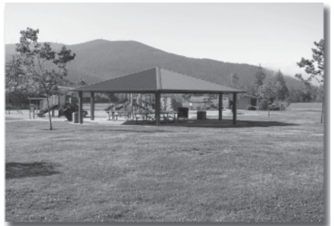
Central Park Picnic Shelter & Play Area